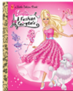
Barbie Fashion Fairytale ISBN: 978-0-307-93859-6