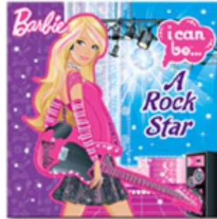
I Can Be a Rock Star ISBN: 978-0-307-93858-9