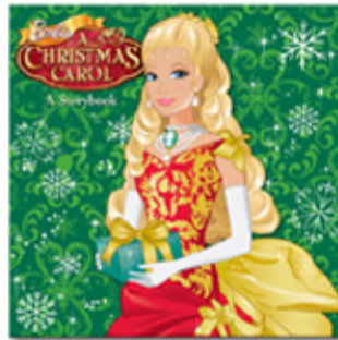
Barbie in A Christmas Carol ISBN: 978-0-307-93857-2