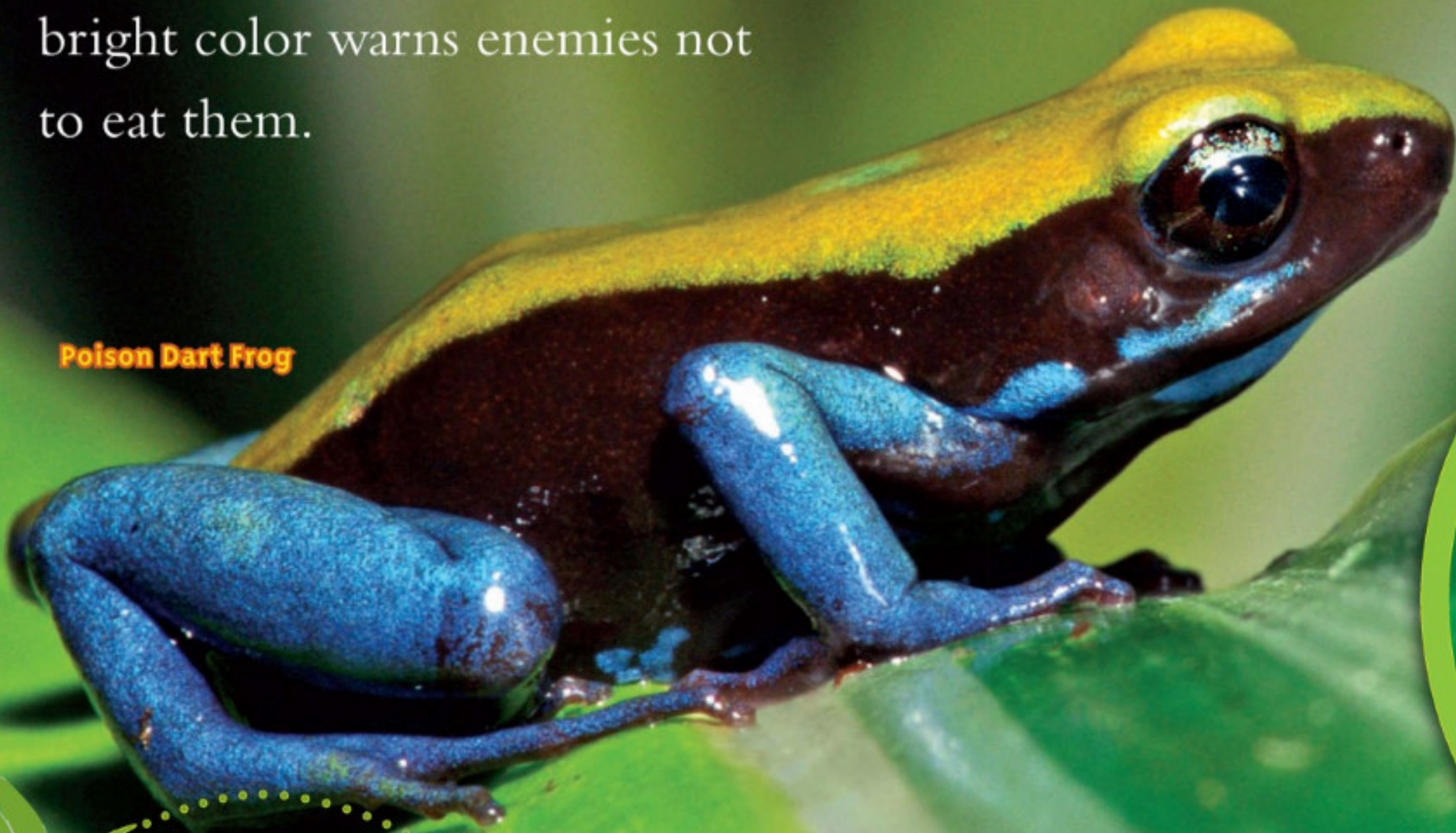
Poison Dart Frog