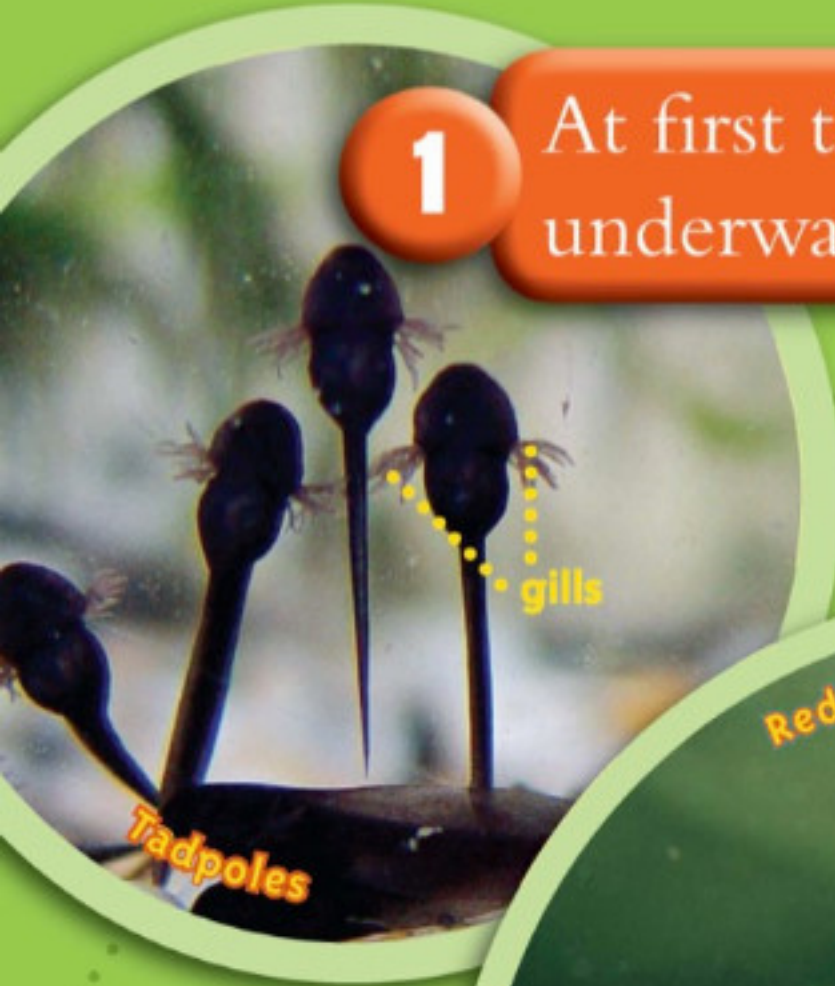
Red-Eyed Tree Frog Tadpoles

At first they breathe underwater with gills.