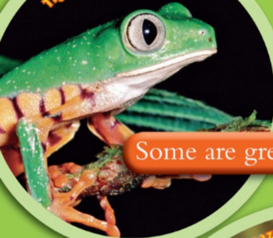
Tiger Striped Leaf Frog