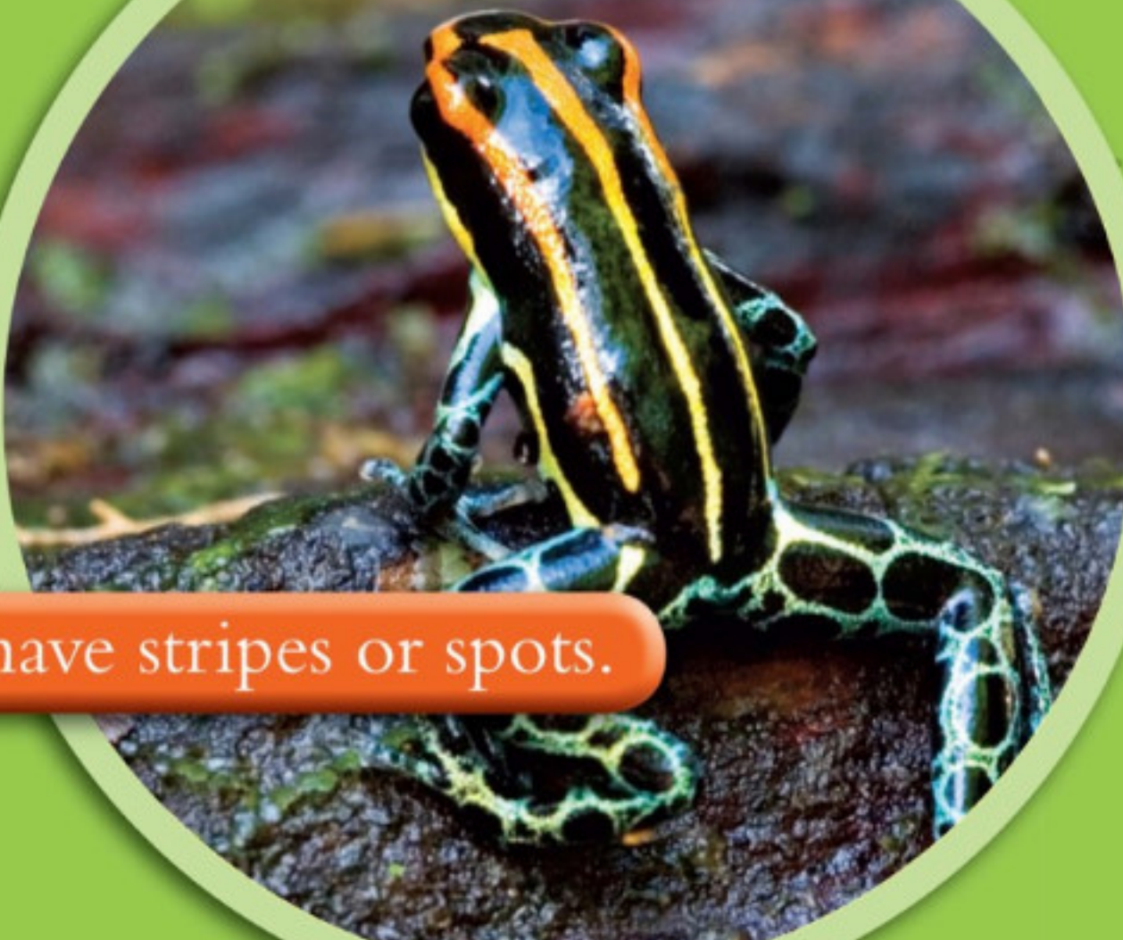
Amazonian Poison Dart Frog