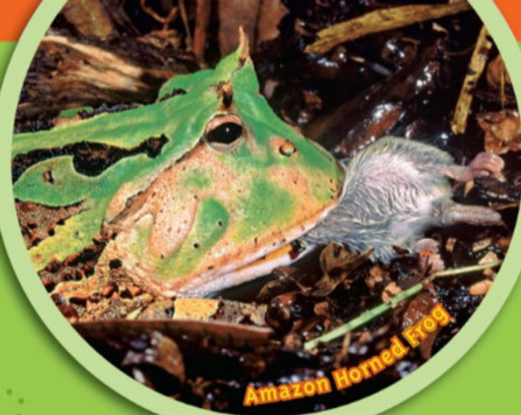
Amazon Horned Frog

Some frogs eat bigger animals like worms and mice. The American bullfrog even eats other frogs!