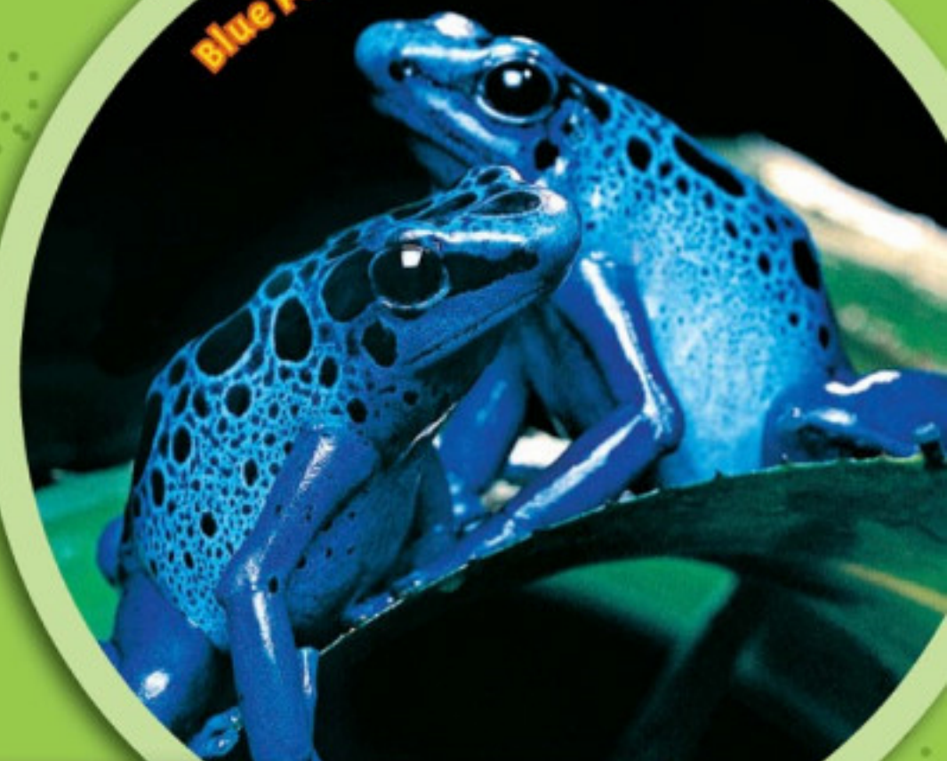
Blue Poison Dart Frog