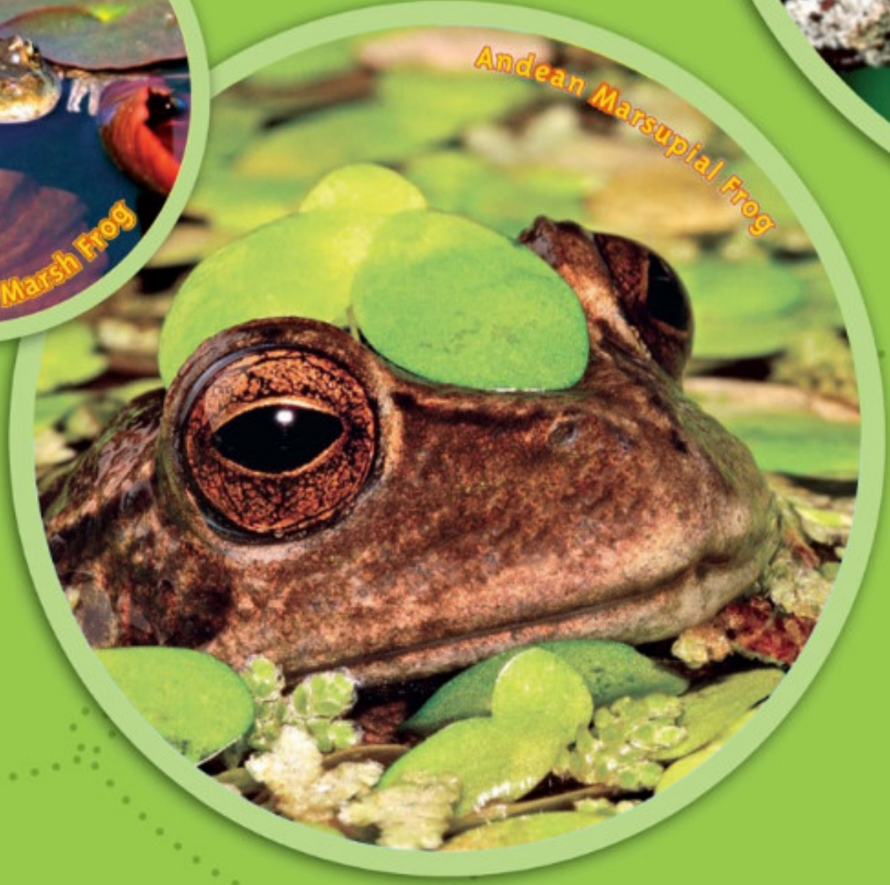
Andean Marsupial Frog