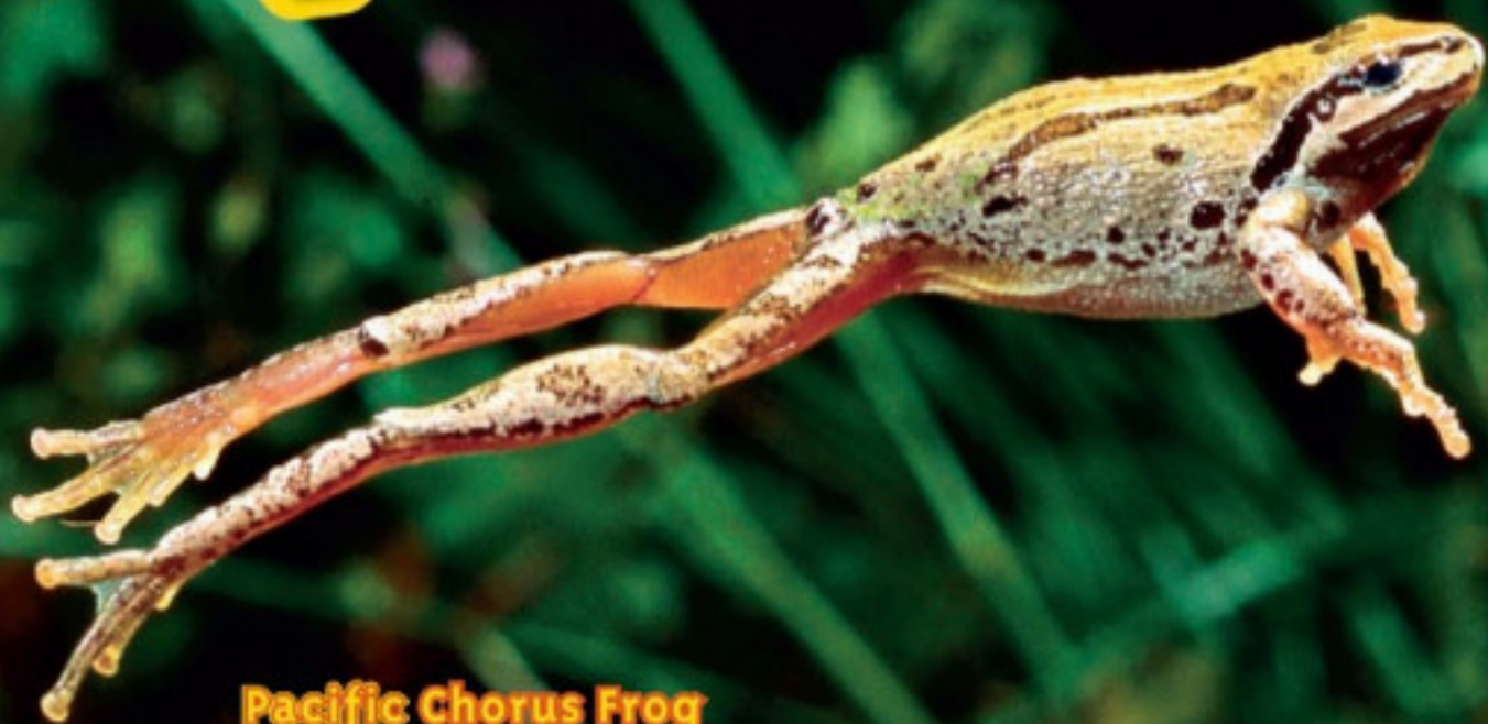
Pacific Chorus Frog