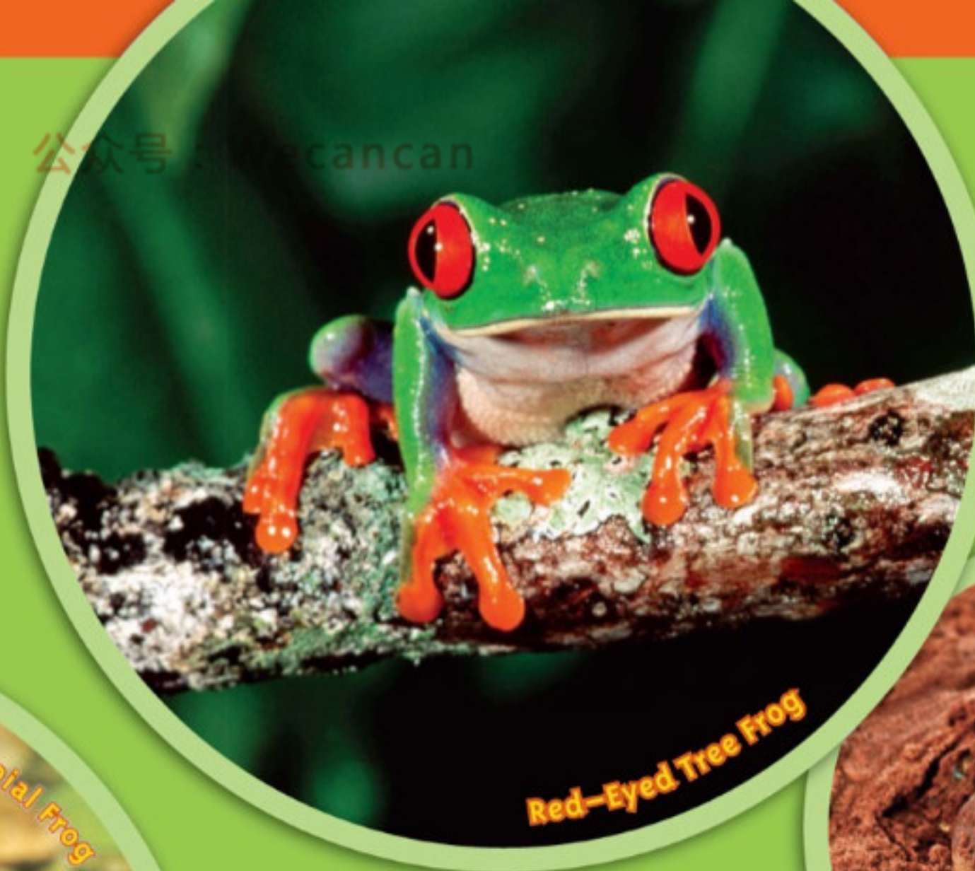
Red-Eyed Tree Frog