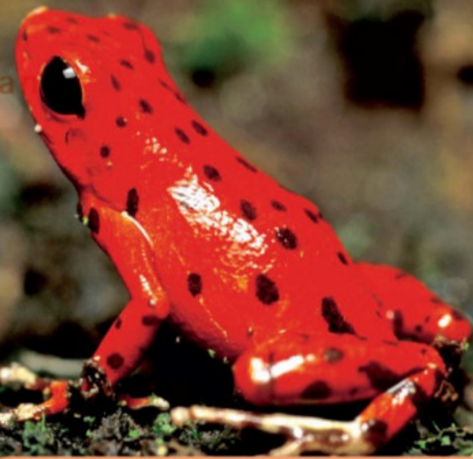
Red Poison Dart Frog