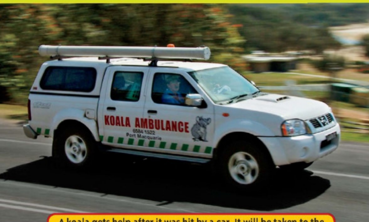
A koala gets help after it was hit by a car. It will be taken to the Koala Hospital in Port Macquarie, New South Wales, in Australia.

Doctors and nurses help koalas that are sick or hurt. Koala hospitals help thousands of koalas every year.