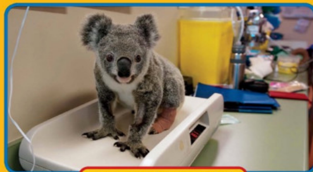
This koala is being weighed.