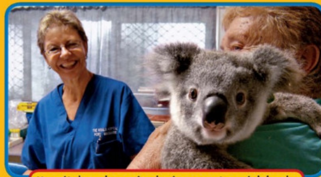
Hospital workers give loving care to a sick koala.