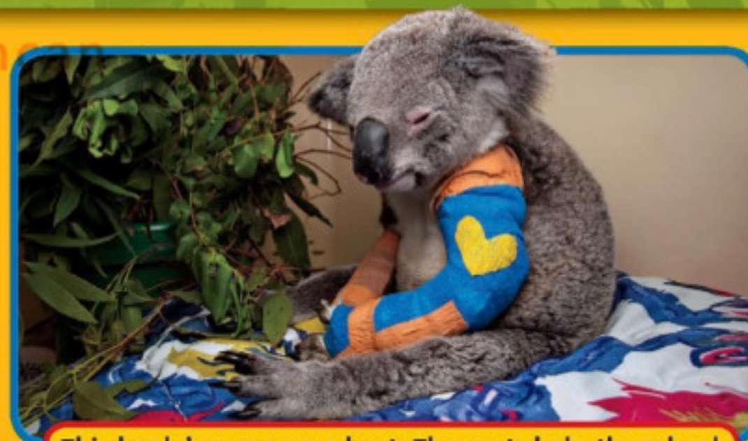
This koala's arms were hurt. The casts help them heal.