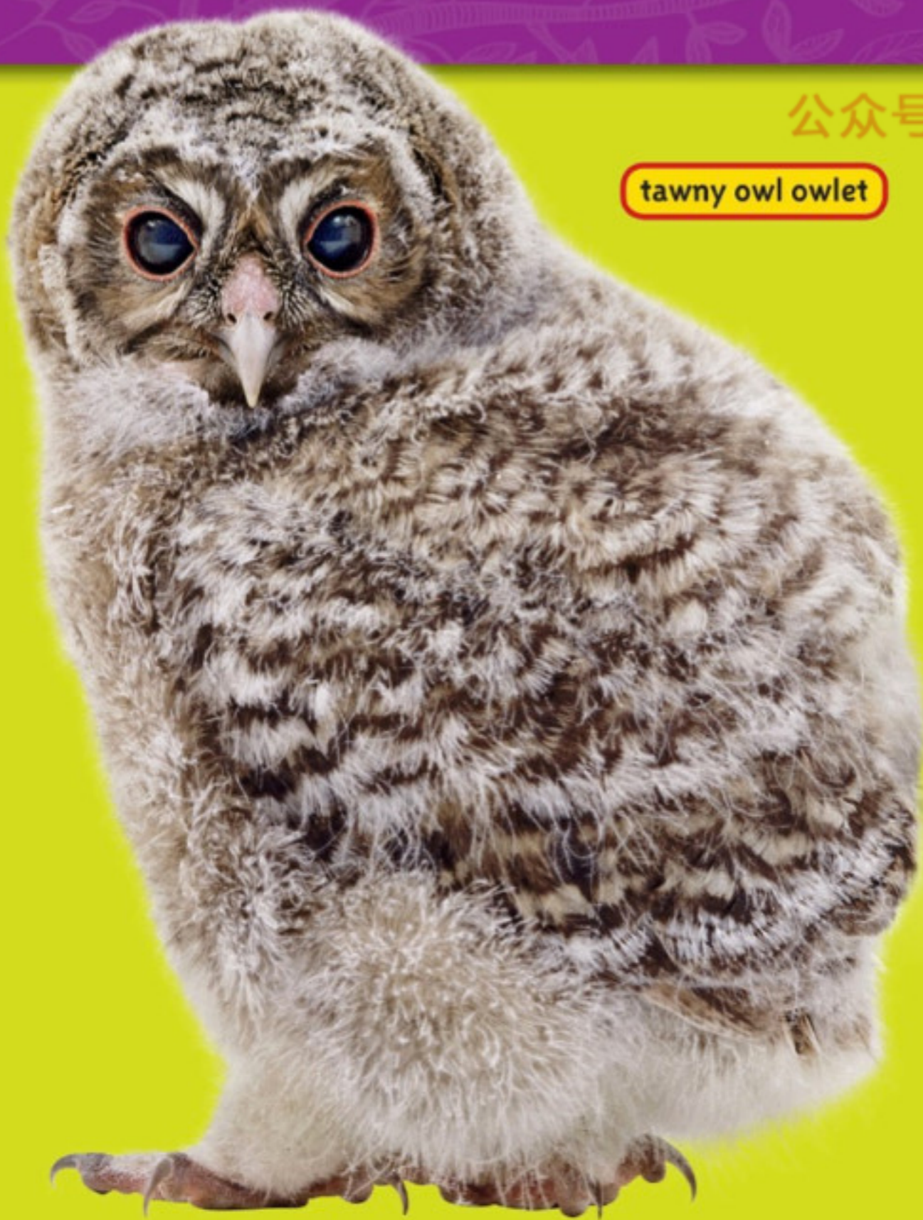
tawny owl owlet

Every day the owlets grow bigger. They grow new feathers, too.