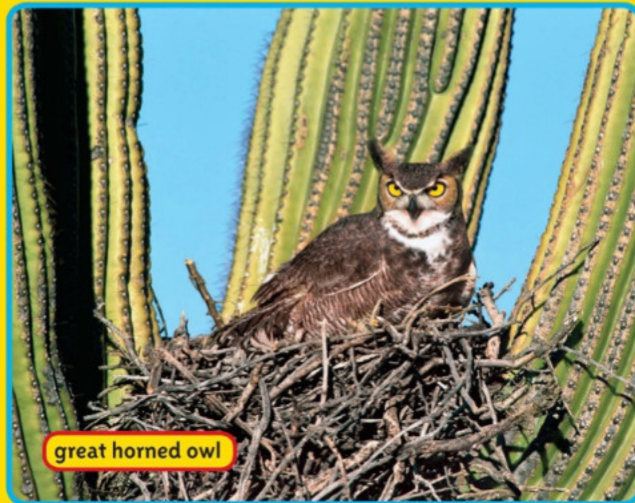
great horned owl

Owls live in cold places and hot places. They live in rain forests and deserts. Owls also live in the mountains and near the ocean.