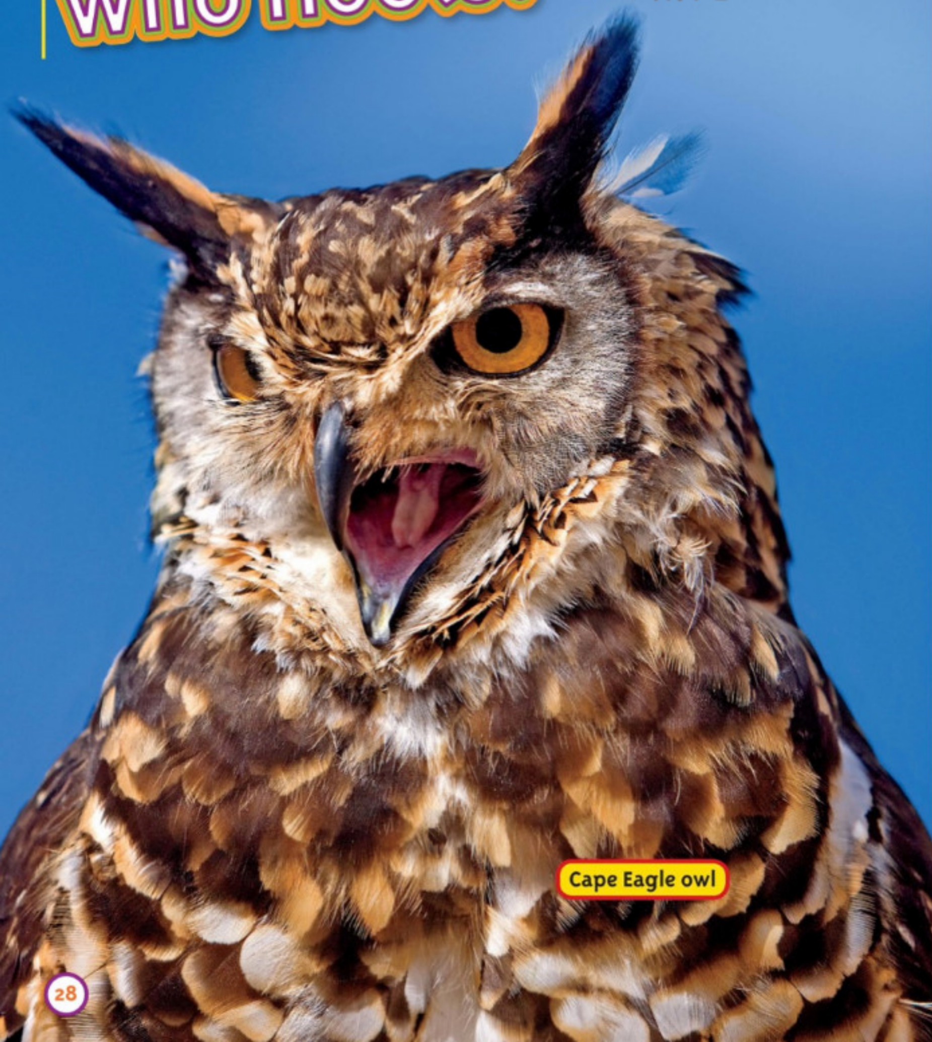
Cape Eagle owl

Try making a hooting call out your window at night. Then listen carefully. An owl just might return your call!