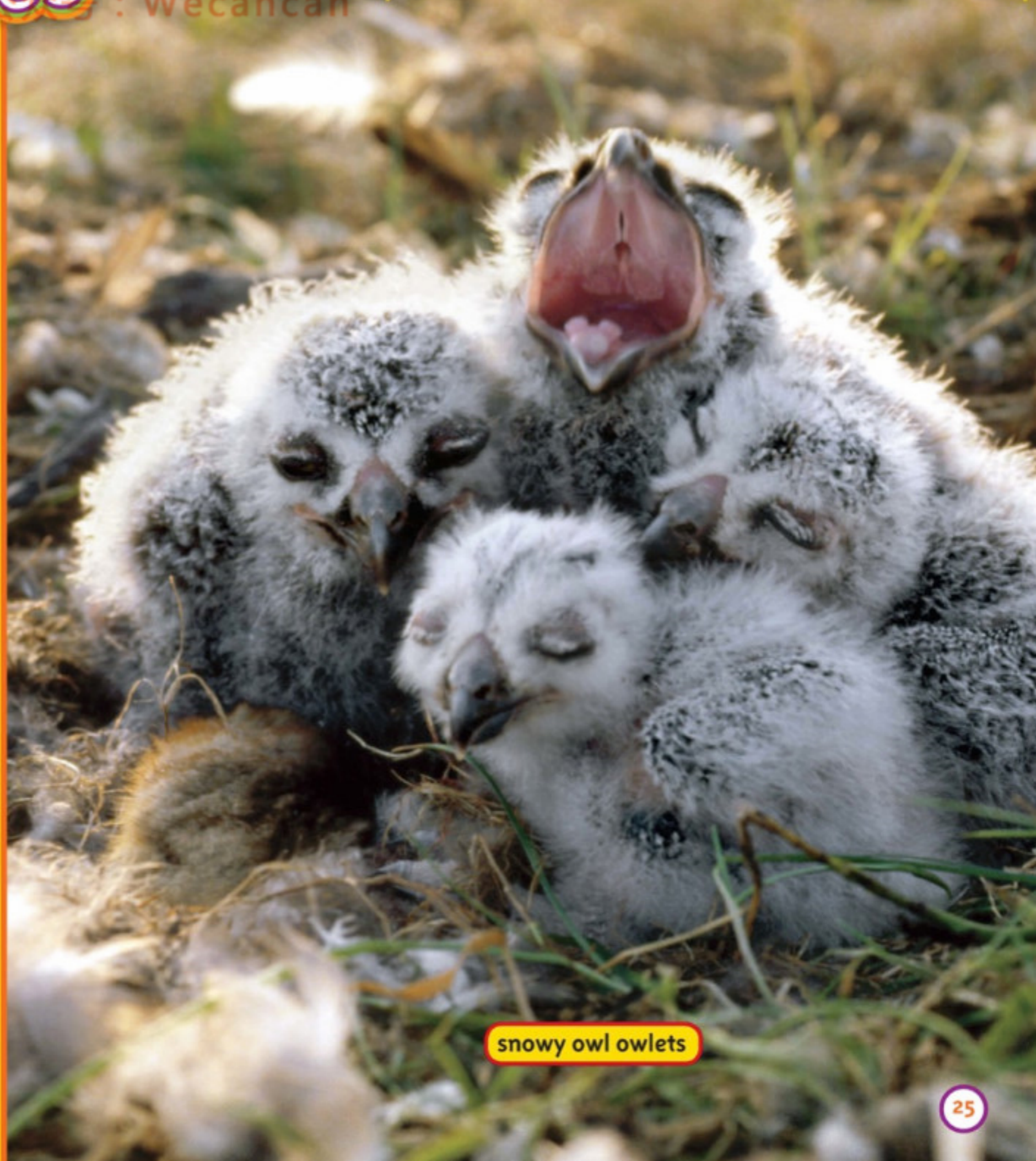
snowy owl owlets