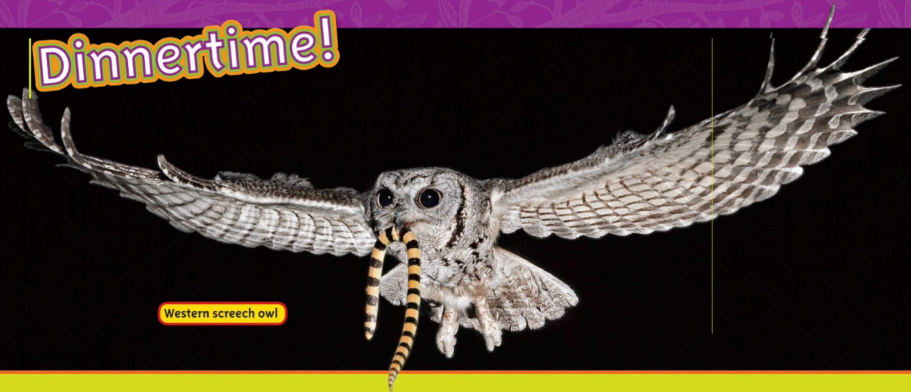
Western screech owl

Many owls eat small animals like mice. Some owls eat insects, snakes, or fish. Other owls even eat small birds and bigger animals, too.