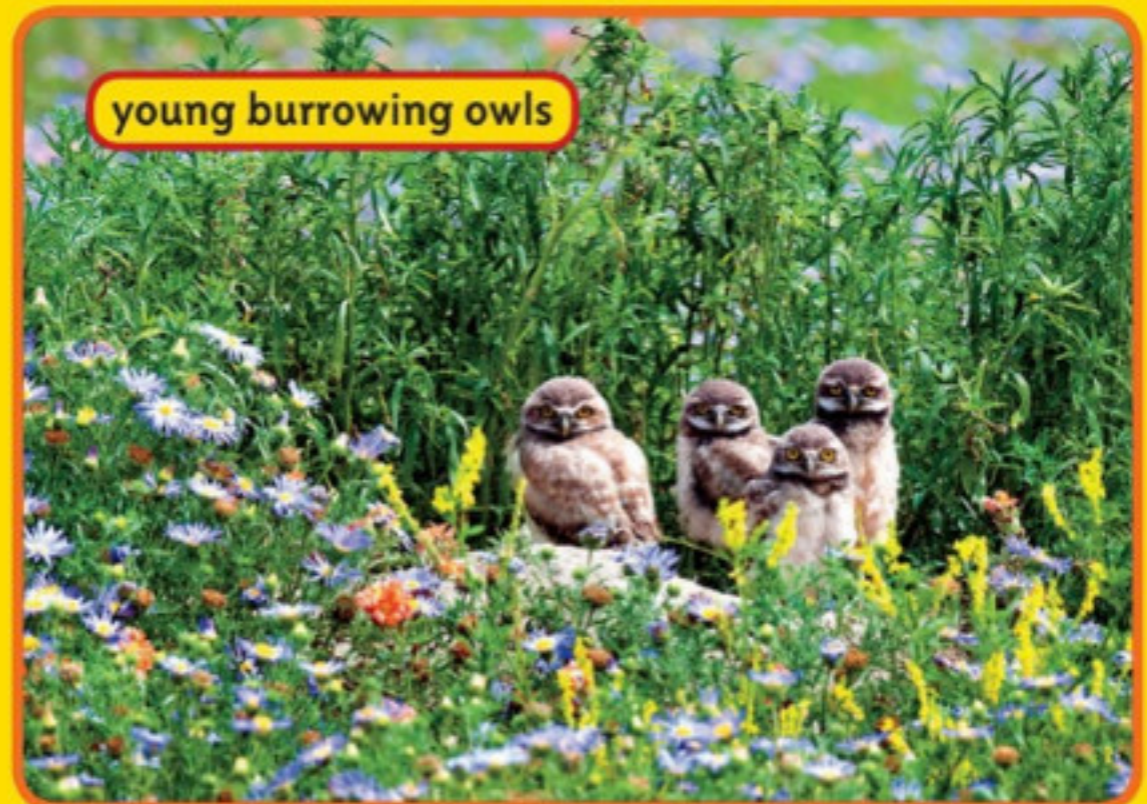
young burrowing owls

But young owls stay in or near a nest. They stay until they learn to fly. Owl nests may be in trees or on the ground.