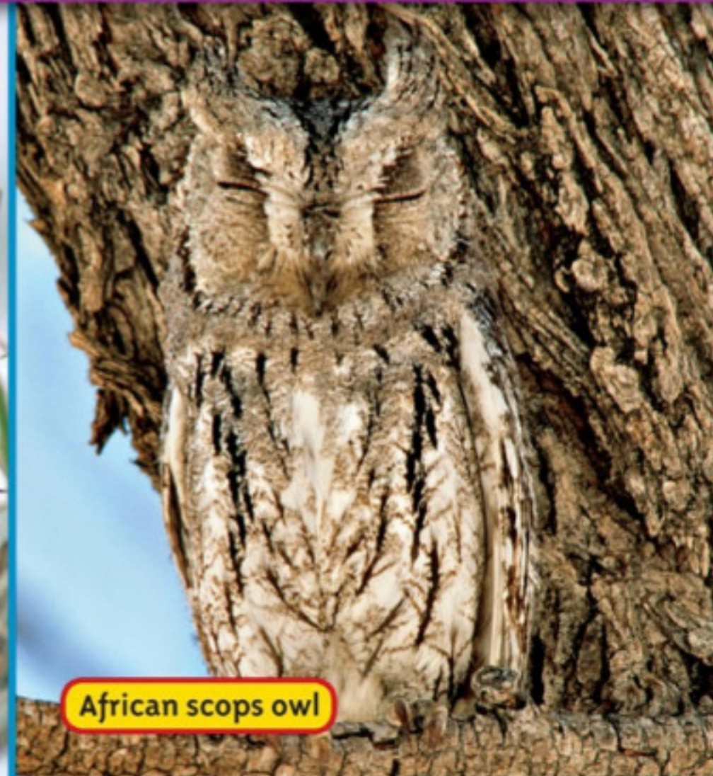
African scops owl