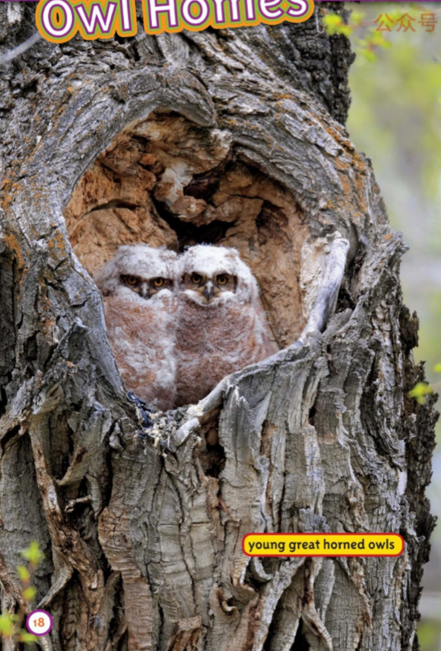
young great horned owls

Owls travel to different areas to hunt. So they don't call one place home. They often just pick a tree to rest in.