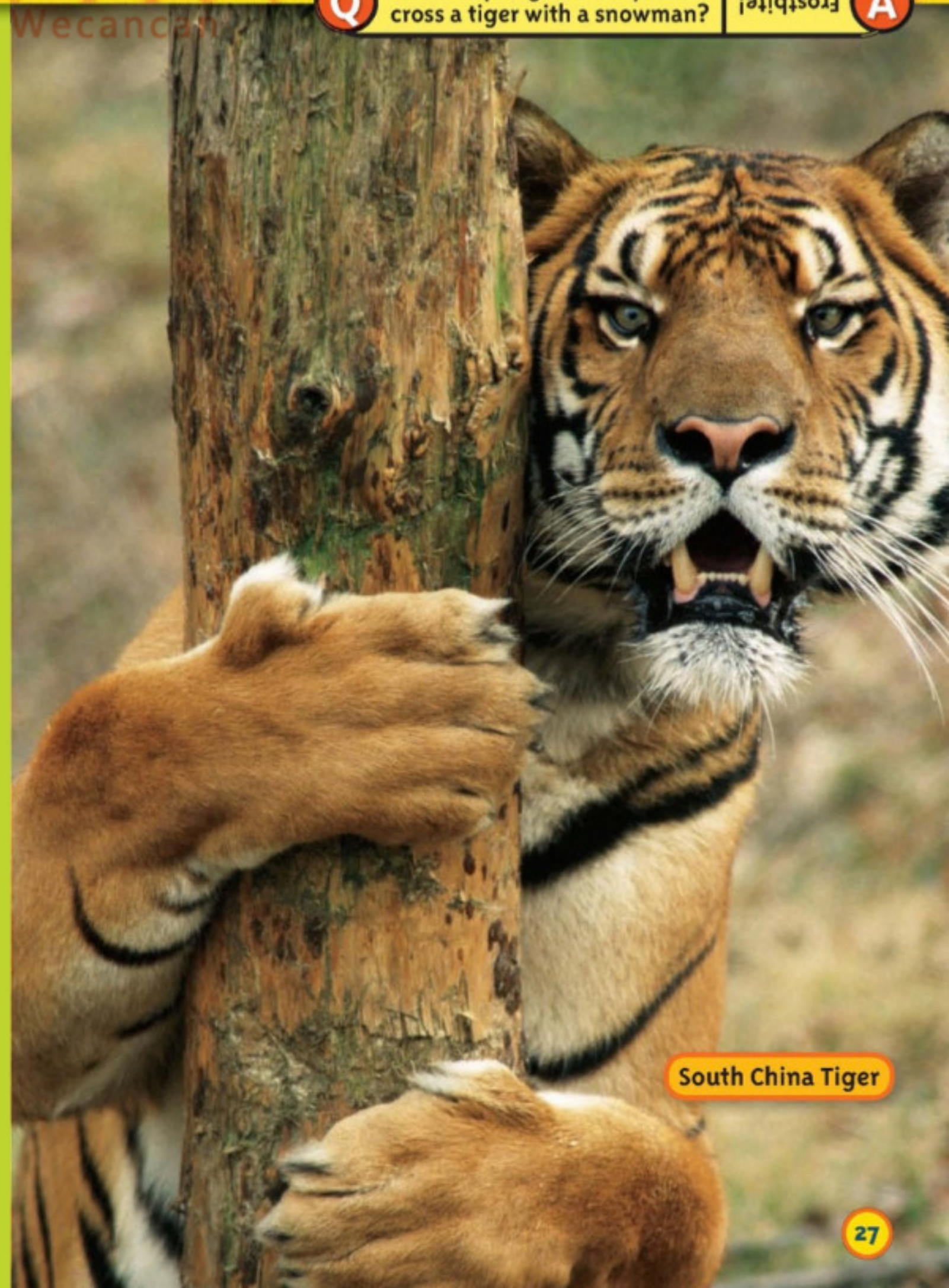
South China Tiger

HABITAT: The place where a plant or animal naturally lives