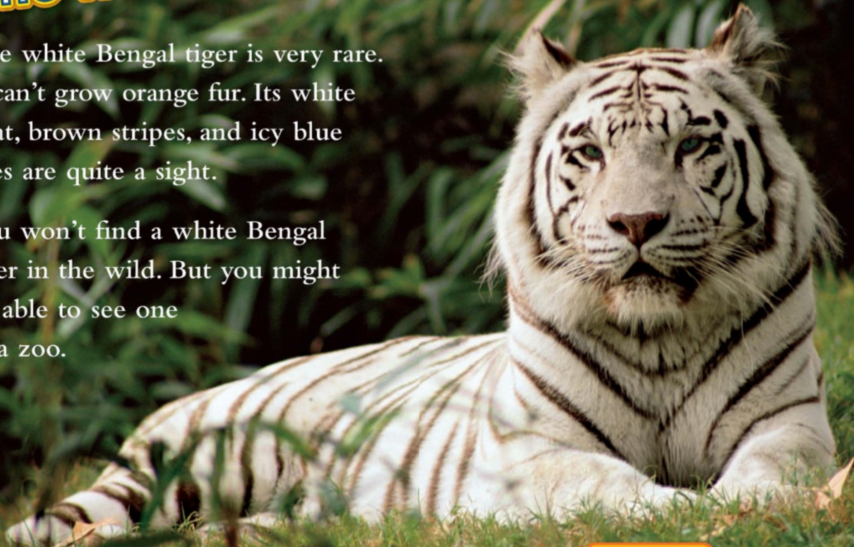
White Bengal Tiger